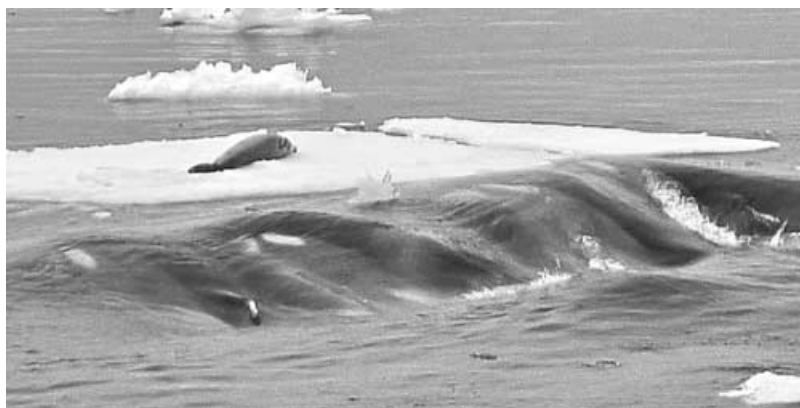
Figure 2. Four submerged killer whales swim two on either side of a stationary killer whale (blowing a bubble burst). They created a wave, which washed the adult crabeater seal off the ice floe, in Grand Didier Channel, W. Antarctic Peninsula on 15 January 2006.

+20.48 min, the seal attempted to climb onto a third ice floe but was pulled back into the water by an AF/SAM killer whale, which had grabbed it by the hind flippers. At +25.32 min, parts of the body of the seal were seen in the mouth of an AF/SAM killer whale, and we could confirm that the seal had been killed. Observations ended at +28.04 min as the group of killer whales moved slowly away from the ship.